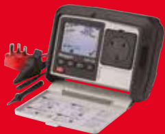
Basic PAT tester PAT120