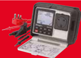
Full function hand-held PAT tester PAT150