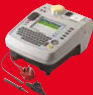
Full database driven PAT tester PAT400 series