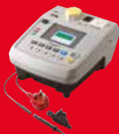
High throughput manual PAT tester PAT300 series