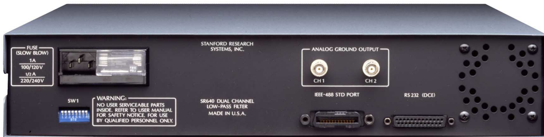
SR640 rear panel