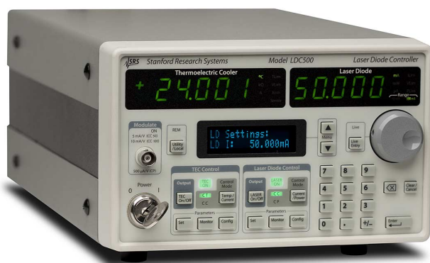
LDC500 Front Panel

The LDC500 series offers an auto-tuning feature which automatically optimizes the PID loop parameters of the controller. Of course, full manual control is provided too. Dynamic transfer between CT and CC modes for the TEC is also easy — just press the Temp/Current button.