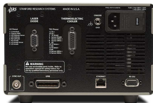
LDC500 Rear Panel