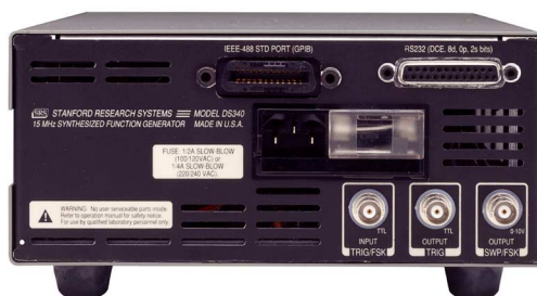
DS340 rear panel (w/ opt. 01)